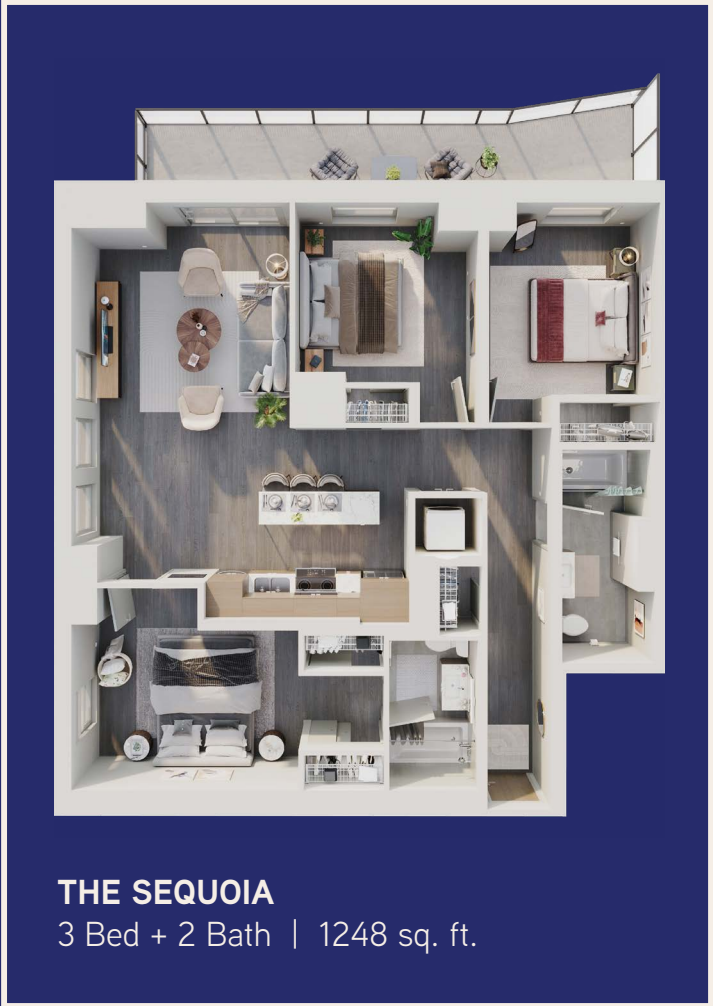
THE SEQUOIA 3 Bed + 2 Bath | 1248 sq. ft.

*4 featured floorplans. Complete selection on website.