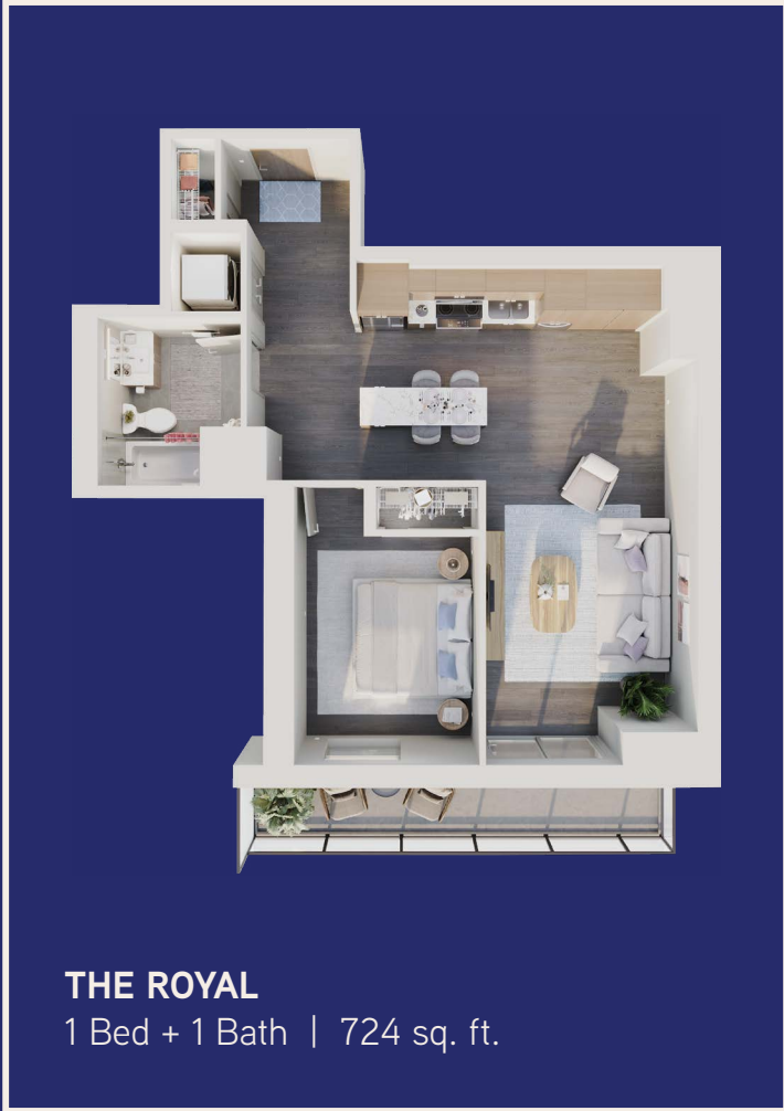
THE ROYAL 1 Bed + 1 Bath | 724 sq. ft.