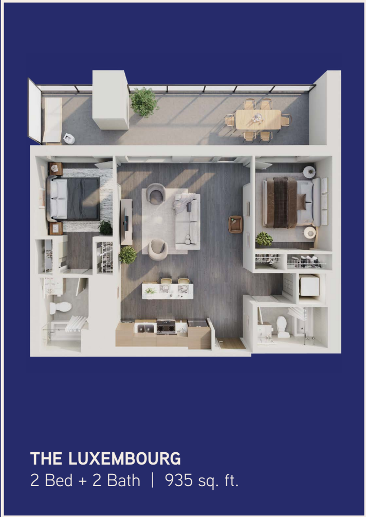
THE LUXEMBOURG 2 Bed + 2 Bath | 935 sq. ft.