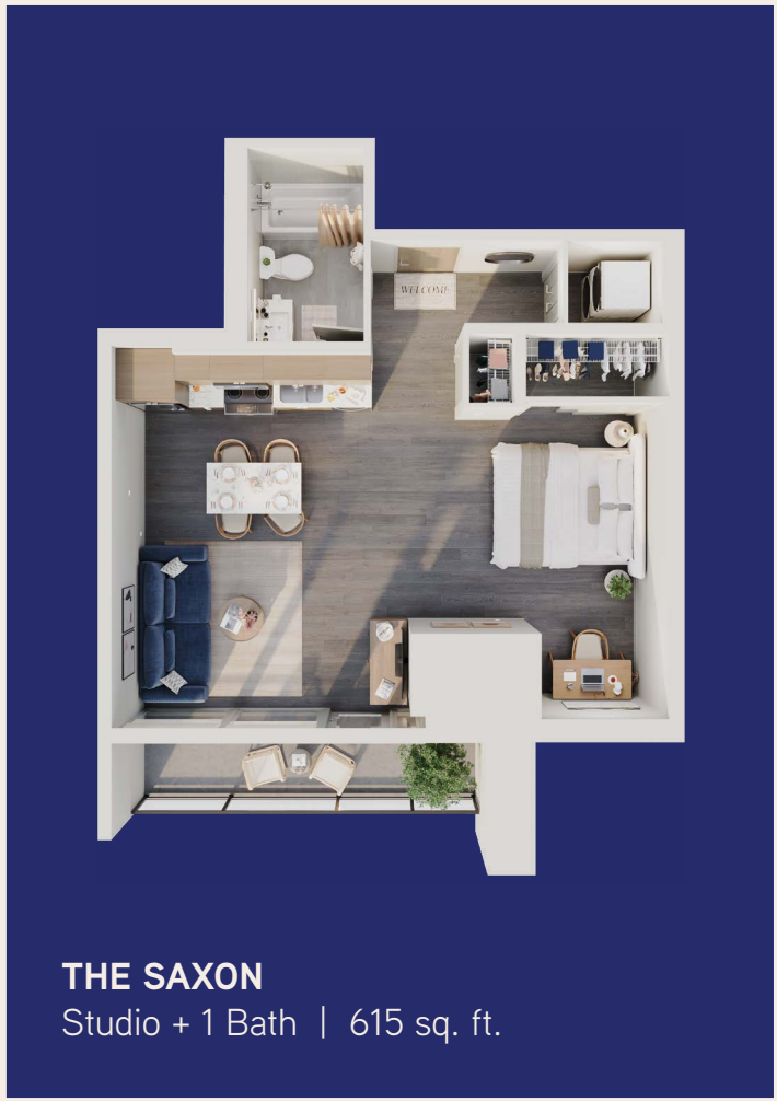
THE SAXON Studio + 1 Bath | 615 sq. ft.